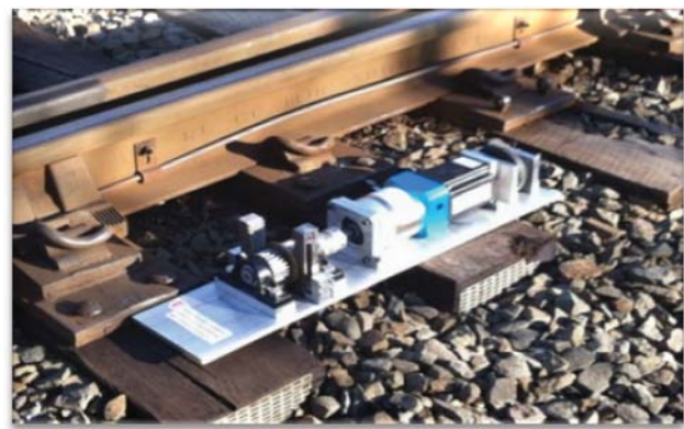
Energy harvester to generate 100 watts of electricity from train-induced track vibrations.

L. Zuo, et al, "High-efficiency energy generator for harnessing mechanical vibration power", US patent publication 20130008157, Publication date Jan 10, 2013, Priority date Apr 15, 2011.