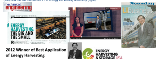
Fig 3 The mechanical motion rectifier (MMR) based railway energy harvester has attract a lot of new media

The mechanical motion rectifier (MMR) based railway energy harvester has attracted a lot of new media attentions and won a national award of Best Application of Energy Harvesting.