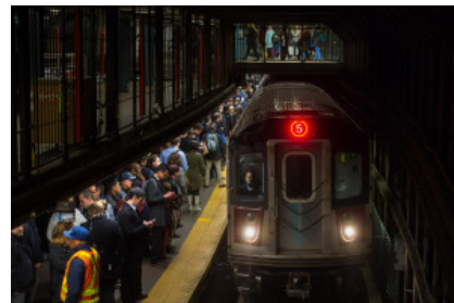
Overcrowding can be eased by stopping people before they enter.

He figures that upgrading to maglev could be completed "within a decade or two," depending on how intrusive the politics get, but insists that it's worth it in the long run. "You won't have to touch it for 100 years. [Maglev] is the technology of the 21st century."