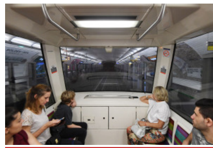
This Paris train shows that even old lines can still modernize.