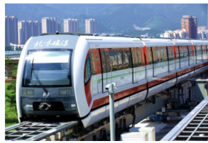
Trains that are propelled by magnets require little maintenance.