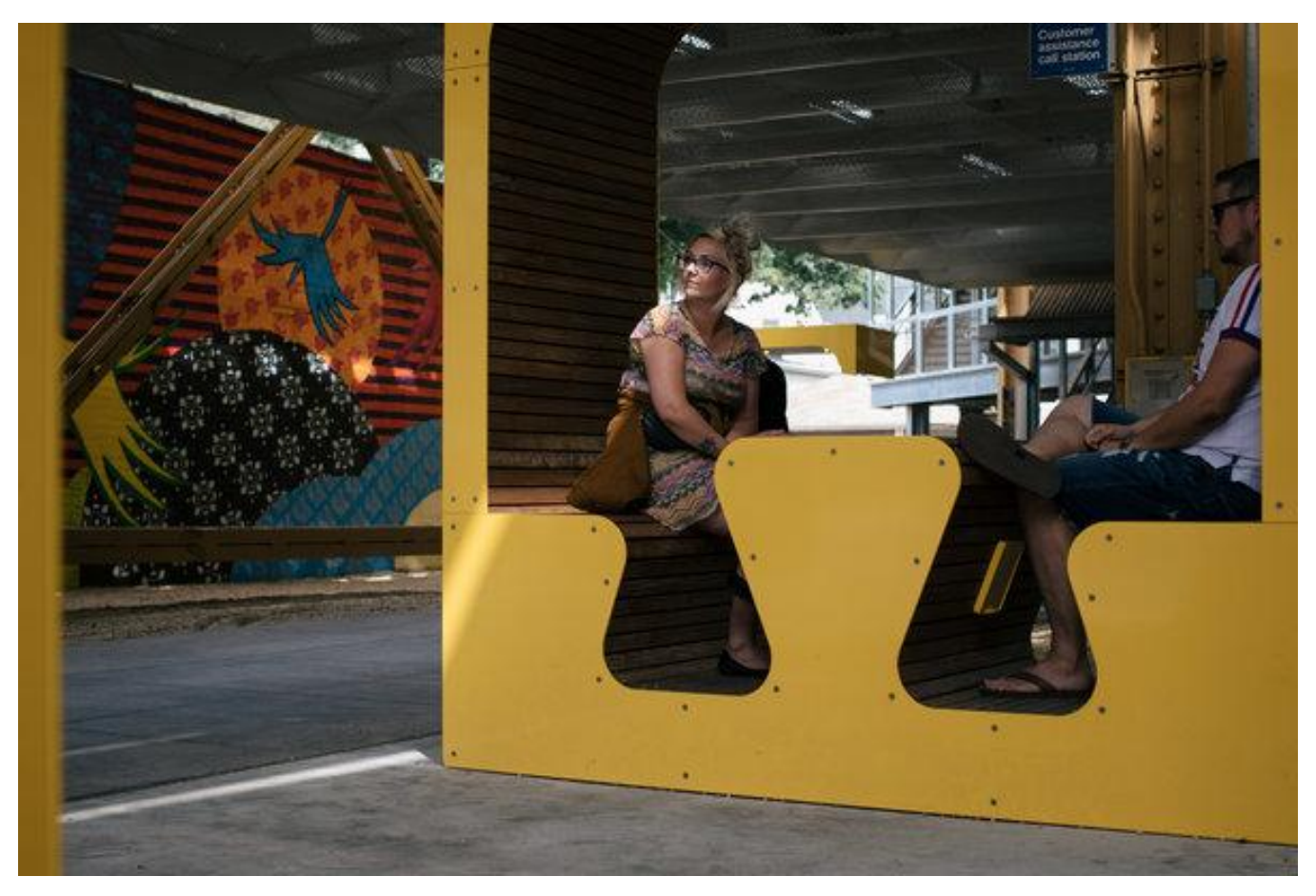
A desolate alley below the elevated tracks of the Paulina Station was converted into a hip plaza with murals and seats.

New York's subway system is far bigger and more complex — as are its infrastructure challenges. In 2017, there were 1.7 billion subway rides in New York, or more than seven times the 230.2 million rides in Chicago.