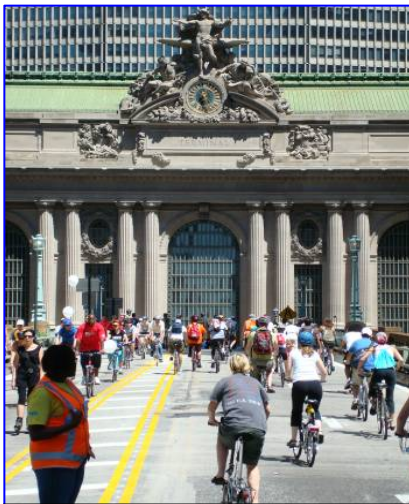
Summer Streets in 2008 and 2009