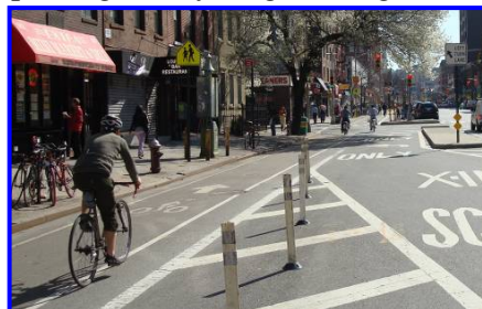
9th Avenue cycle track in Manhattan

Although cycling has almost doubled in New York City since 1990, it lags far behind the other case study cities in almost every respect. It has the lowest bike share of commuters, the highest cyclist fatality and injury rate, and the lowest rate of cycling by women. New York has built the most bikeways of any North American city since 2000 and has been especially innovative in its use of cycle tracks, buffered bike lanes, bike traffic signals, bike boxes, and sharrowed streets. Yet New York has almost completely failed in the important areas of bike-transit integration and cyclist rights and falls far short on bike parking and cycling training.